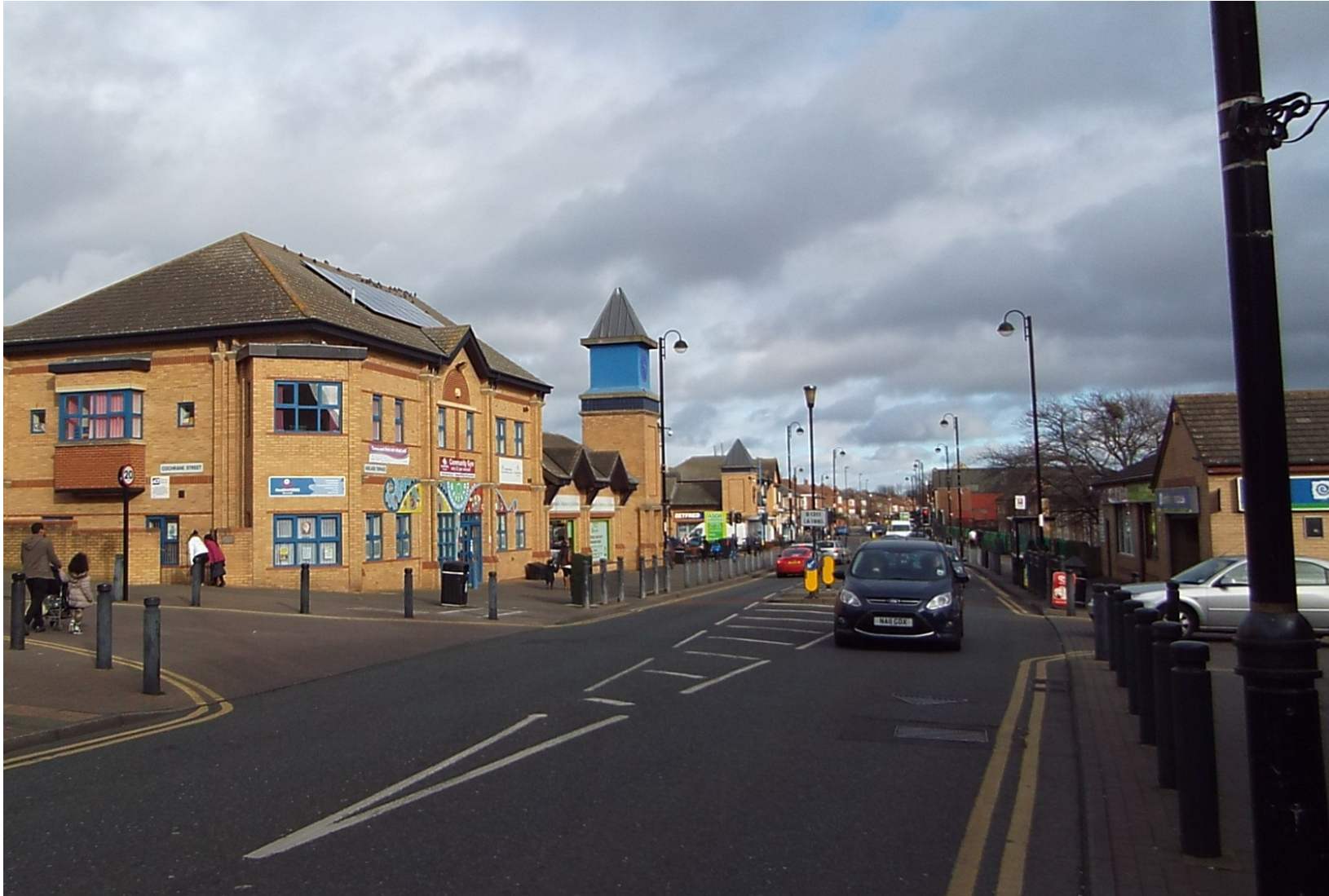
This photograph shows Adelaide Terrace from the corner of Cochran Street. What has changed since the Aldersons lived there?