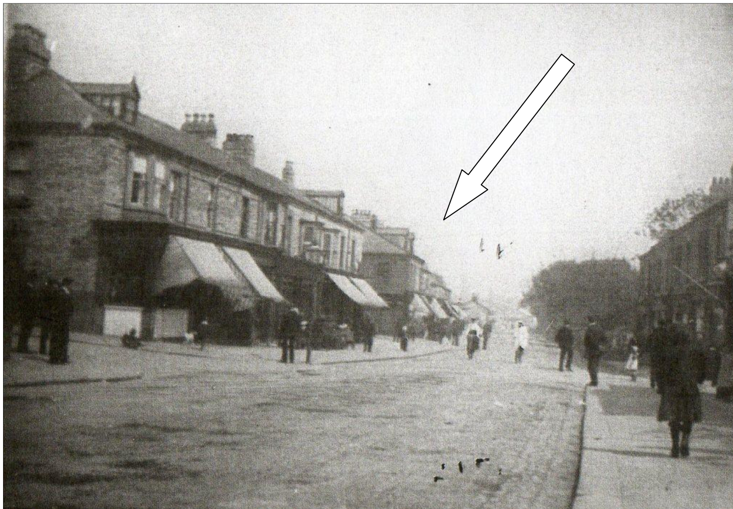
Photo of Adelaide Terrace in 1900